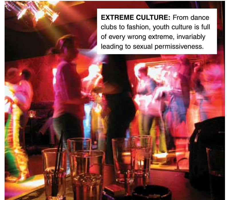
EXTREME CULTURE: From dance clubs to fashion, youth culture is full of every wrong extreme, invariably leading to sexual permissiveness.

In fact, in Ohio, advocates of sex education want the state Department of Health to stop all funding of abstinence-only programs.